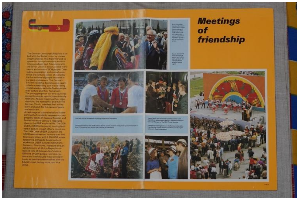
Fig. 14: Page of a pamphlet on GDR-USSR Friendship sent to Swarnkar by RBI. Exact date of reception unknown, Private Collections Rajendra Kumar Swarnkar, photo Jyothidas KV © author, April 4, 2022.