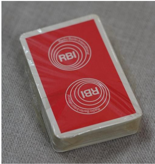
Fig. 12: Deck of playing cards issued by the station. The plastic cover was never removed. Date of reception unknown, Private Collections Rajendra Kumar Swarnkar, photo Jyothidas KV © author, April 4, 2022.