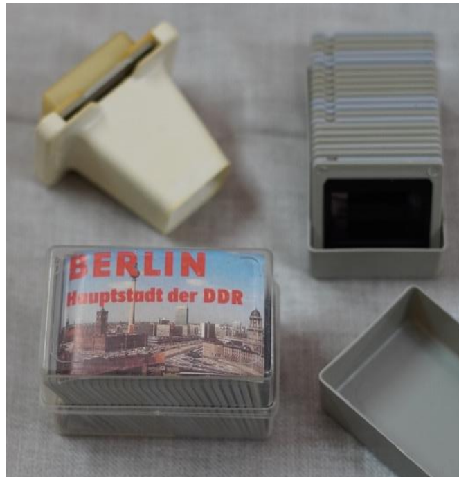
Fig. 13: Manual slide-viewer ( Dia Betrachter ) and two sets of slides with GDR landscapes and images of Berlin's urban landscape. Date of reception unknown, Private Collections Rajendra Kumar Swarnkar, April 4, 2022.